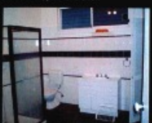
Old bathroom, pre-renovation