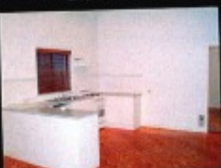
Old kitchen, pre-renovation