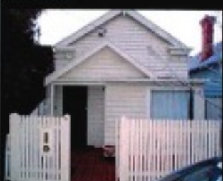
Street frontage, pre-renovation