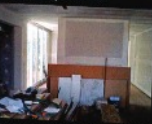
Dining area and kitchen, during renovation