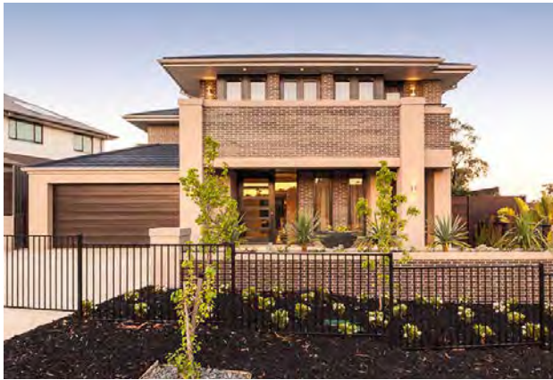
METRICON HOMES South Australia

The Chicago is influenced by modern living. It delivers a striking sense of style, comfort and high quality craftsmanship. The timeless, classically-styled façade ensures a commanding street presence.