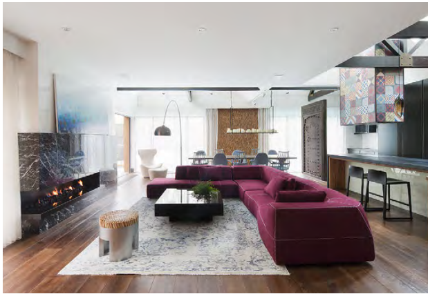
SPACEMAKER HOME EXTENSIONS Victoria

Each of this home's three levels has been extended. The spacious living and kitchen zone opens to a large, north-facing alfresco. The Moroccan encaustic tiles feature both inside and out, making for stylish year-round entertaining.