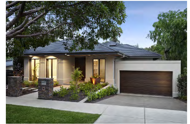
STONEHAVEN HOMES Victoria

Boasting quality finishes and attention to detail throughout, judges commented this is a striking five-bedroom home. The generously sized home was built on a 10-metre-wide allotment at a very reasonable cost.