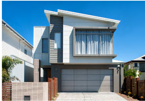
PLANBUILD HOMES Queensland

The Chicago is influenced by modern living. It delivers a striking sense of style, comfort and high quality craftsmanship. The timeless, classically-styled façade ensures a commanding street presence.