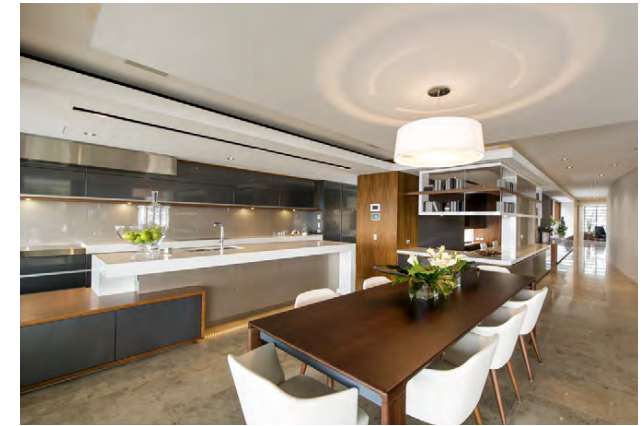
GIORGI EXCLUSIVE HOMES Western Australia

This townhouse boasts luxurious appointments and meticulous attention to detail. The judges were particularly impressed with the use of high quality fixtures and fittings, exhibiting the ultimate in fine detailing.