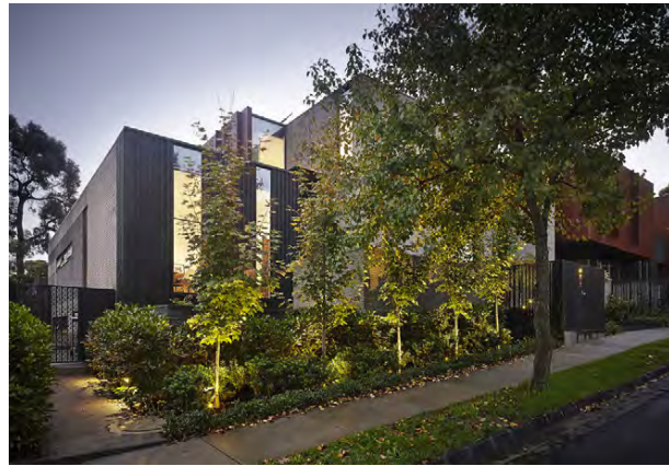
BCG CONSTRUCTIONS PTY LTD Victoria

Each of this home's three levels has been extended. The spacious living and kitchen zone opens to a large, north-facing alfresco. The Moroccan encaustic tiles feature both inside and out, making for stylish year-round entertaining.